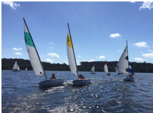
The Youth Group playing "Follow My Leader"

Looking forward to a fine September and October to round off the season and hoping to have a mini race series as in previous years, with fun and games on the last day at the end of October.